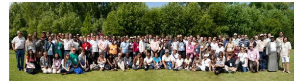
WG14 in Buenos Aires, Argentina in November 2011