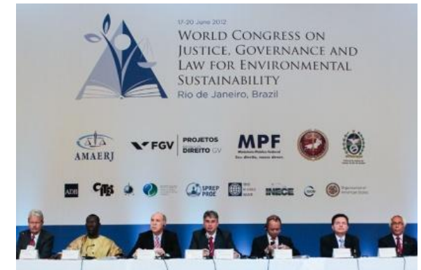
The Congress on Justice, Governance and Law for Environmental Sustainability presented a declaration to the Heads of Rio+20.