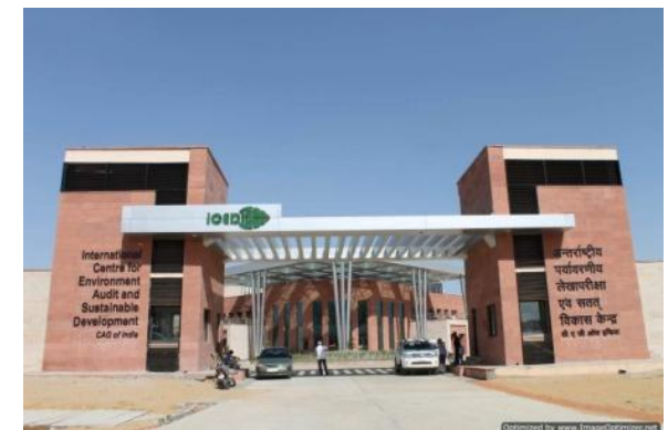
Global Training Facility for environmental auditors in Jaipur, India