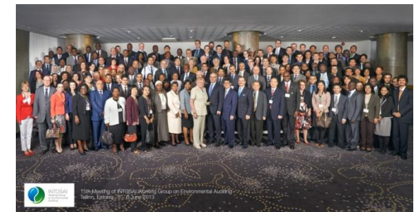
WG15 in Tallinn, Estonia in June 2013