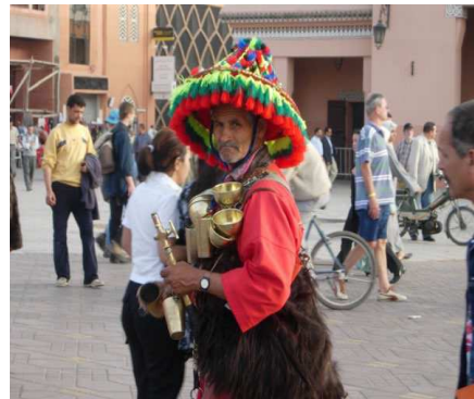
Jamaa El Fna Square