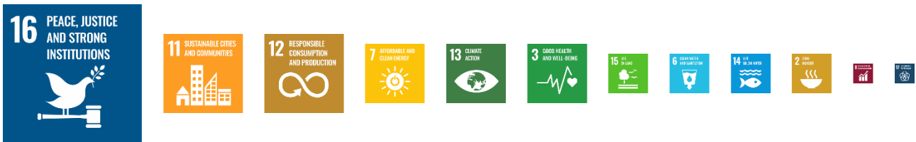
Figure 2. SDGs covered by the WGEA reports in 2016-2022. The size of the SDG indicates the amount of reports related to the topic.

Yet another way to scrutinize the SDG coverage is to analyse which SDG-areas audits by SAIs have dealt with. Based on an analysis of the SAIs voluntary submissions to the WGEA audit database, and concentrating only to the environmental SDGs, SDG 11 received most attention, while SDG 12 and water-related SDGs (6 and 14) have been audited less.