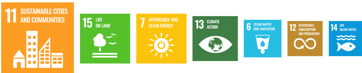
Figure 3. SDGs covered by the SAI audits in 2019-2022 (up to May 2022) in the WGEA audit database. The size of the SDG logo indicates the amount of audits presented as number below the logo.

Yet another way to scrutinize the SDG coverage is to analyse which SDG-areas audits by SAIs have dealt with. Based on an analysis of the SAIs voluntary submissions to the WGEA audit database, and concentrating only to the environmental SDGs, SDG 11 received most attention, while SDG 12 and water-related SDGs (6 and 14) have been audited less.