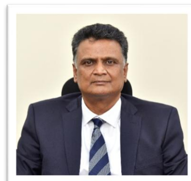
Mr. K Sanjay Murthy, Comptroller and Auditor General of India

The Comptroller and Auditor General (C&AG) of India is a Constitutional Authority appointed by the President of India to head the Supreme Audit Institution (SAI) of India. The mission of the C&AG is to promote accountability, transparency and good governance through high quality auditing of public receipts and expenditure in order to provide independent assurance to stakeholders that public funds are being used efficiently and only for the intended purposes.